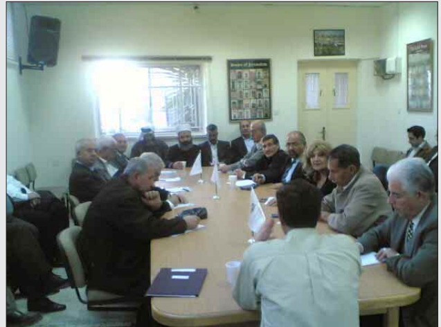
Ilaboun, Galilee, The Catholic Melkite Church Hall, Saturday 19 April 2008

and their contributions to Arab/Islamic renaissance in the Middle Ages."