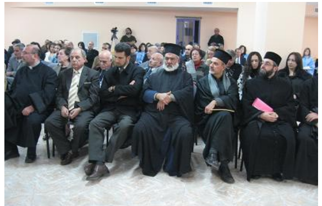
Christmas celebration in Bethlehem 2006

My question as a Palestinian Christian is: Since God in His almighty had taken the initiative to reconcile man with Him, why are people then indisposed to reconcile themselves with each other? Why do the strong impose impossible conditions on the weak? Why is not the strong open to love reconciliation with the other and remove all barriers that separate them? Why do not the leaders of great countries especially the USA, and they are all Christians, take