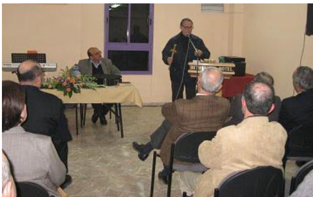
Christmas celebration in Bethlehem 2006

On the other hand, I urge the Palestinians to work hard for their national unity. It is a wrong and a sin which all factions are to blame for if they do not find a common political vision and common principles on which they agree and provide services, and which will eventually lead them to the establishment of an independent Palestinian state with East Jerusalem as its eternal capital.